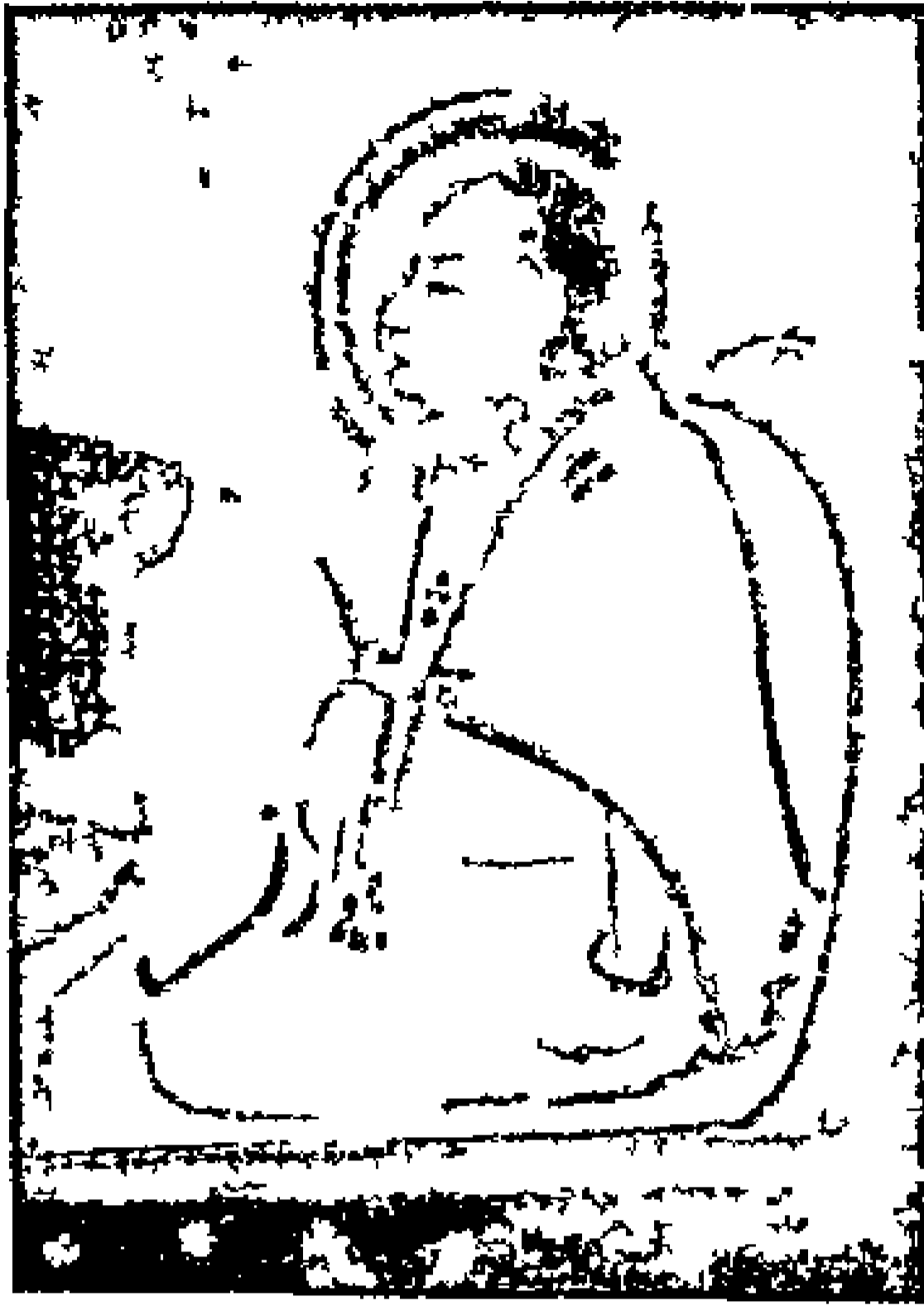
Goswami Shri Yogi Gopeshwaraji See page 346